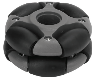
The Omni Wheel will make the Belt Cane easier to use on a wider variety of terrain.

Throughout our testing, we are listening to Belt Cane users and are committed to hearing what they have to tell us. We are learning together, and we are unwavering in our support of safe mobility for children with a MVI/B.